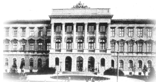
Lviv Polytechnic National University Main Building

Lviv Polytechnic National University Students' and PhD Students' Union and Self-government Young Scientists' Council